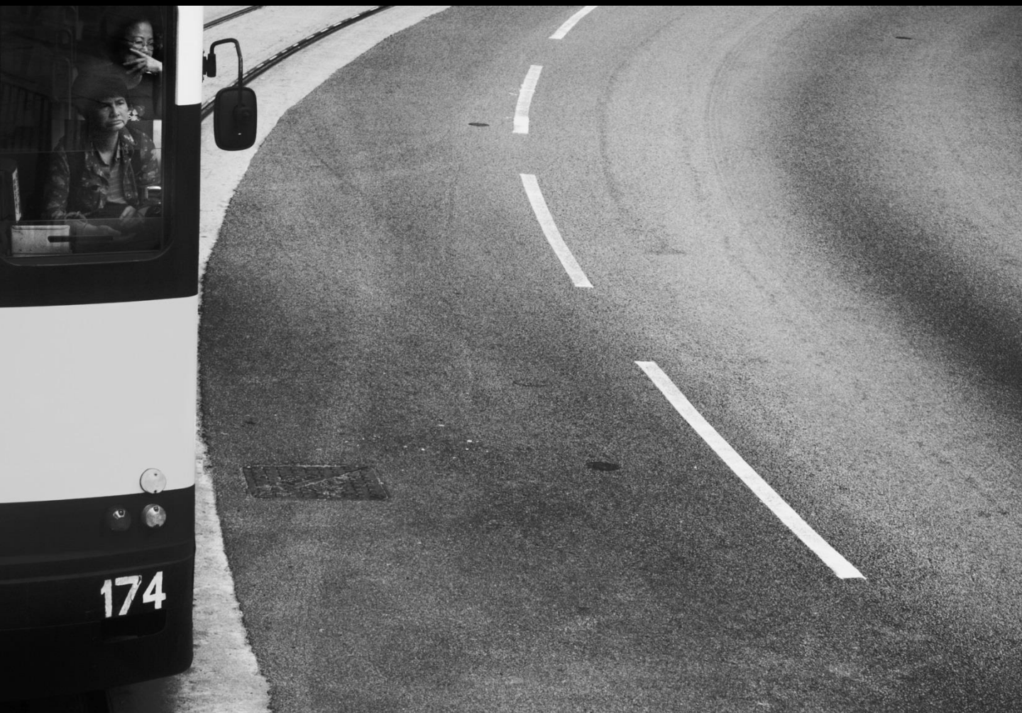
In the pensive mood