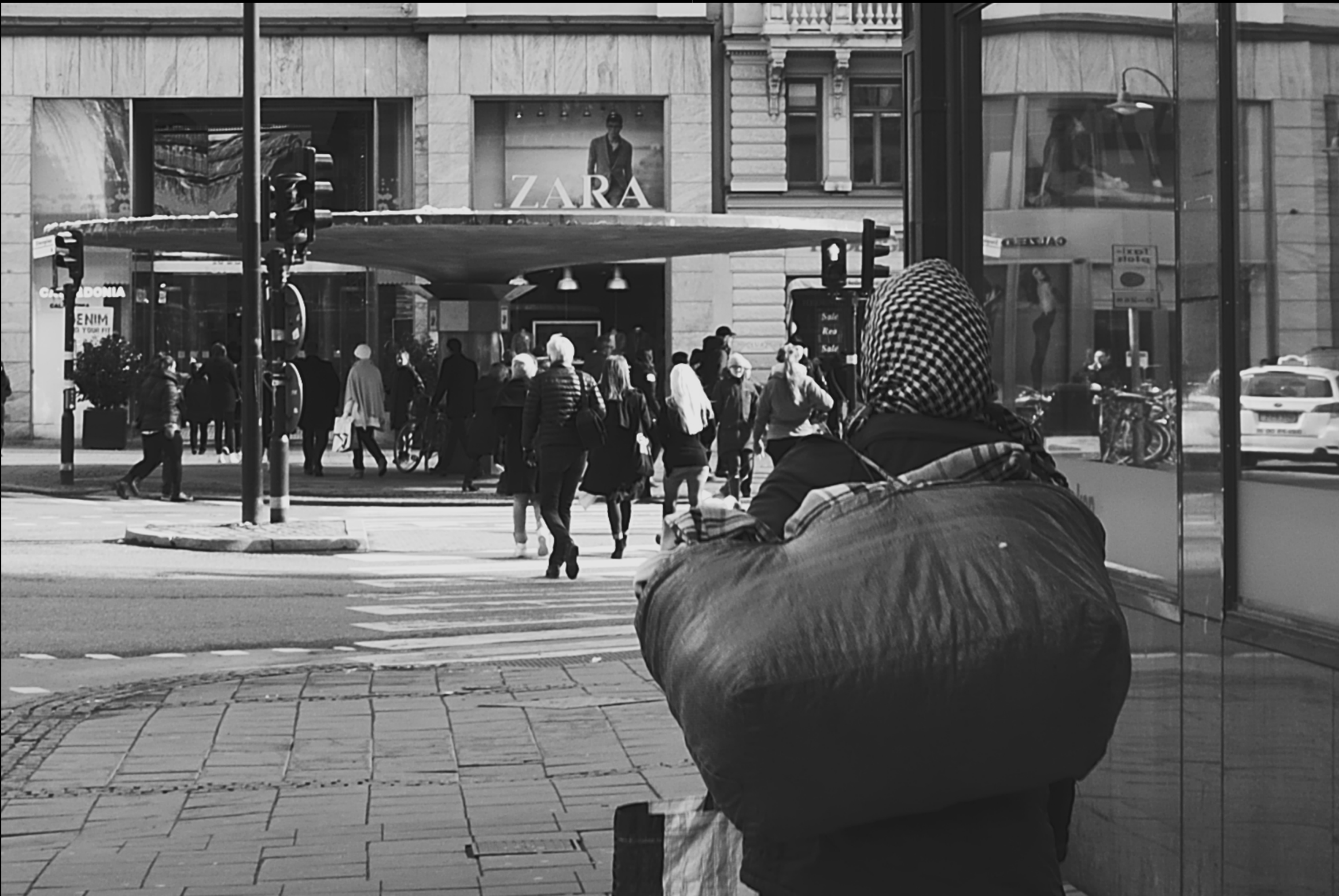
A woman who has all her life in one bag. She is looking at luxury shops, although knowing that she couldn't buy anything. Stockholm, 2015.