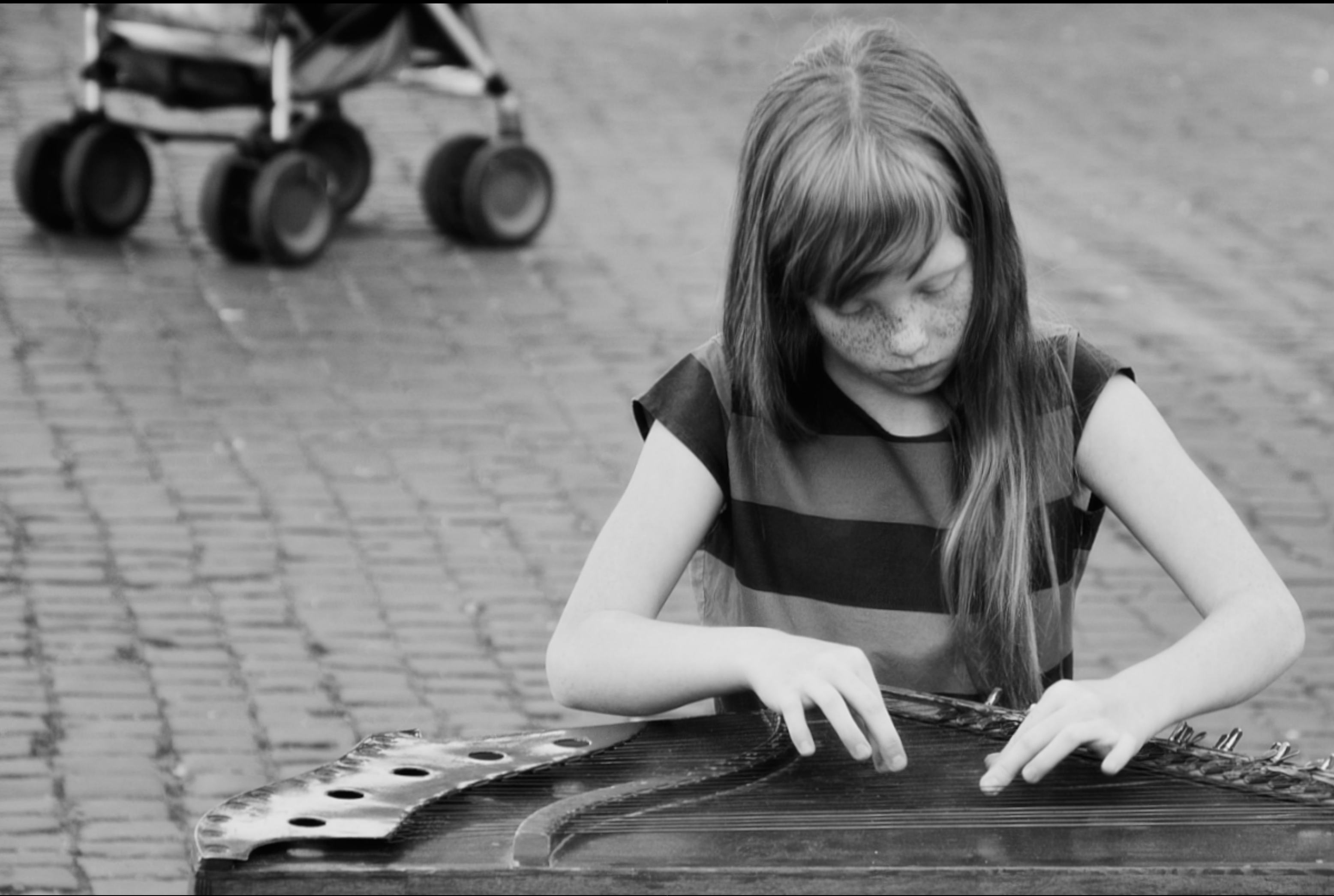
A very young girl playing on the zither. Vilnius, 2015.