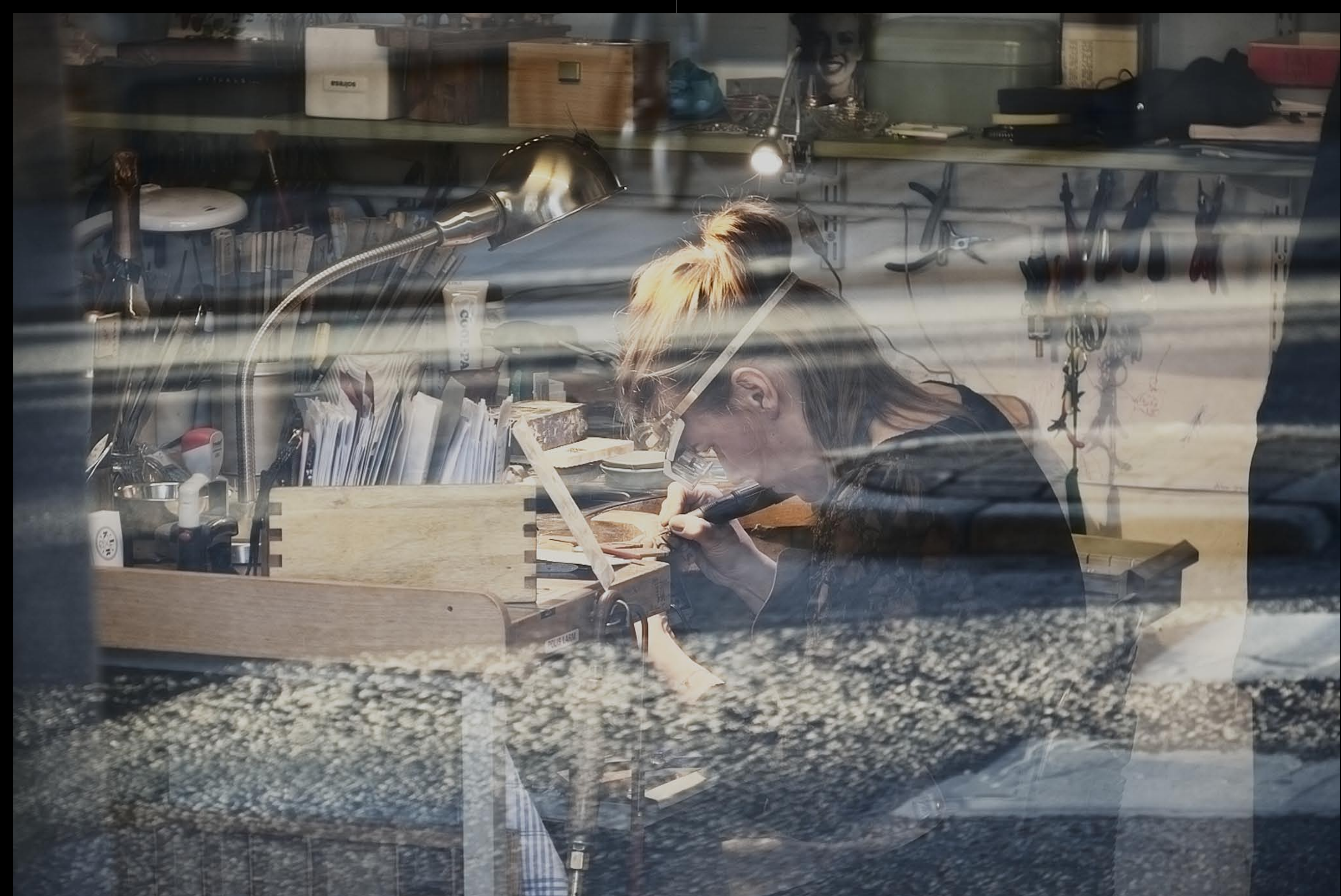
The girl with the working hands. People past her workshop and didn't even realize her concentration. Stockholm, 2015.