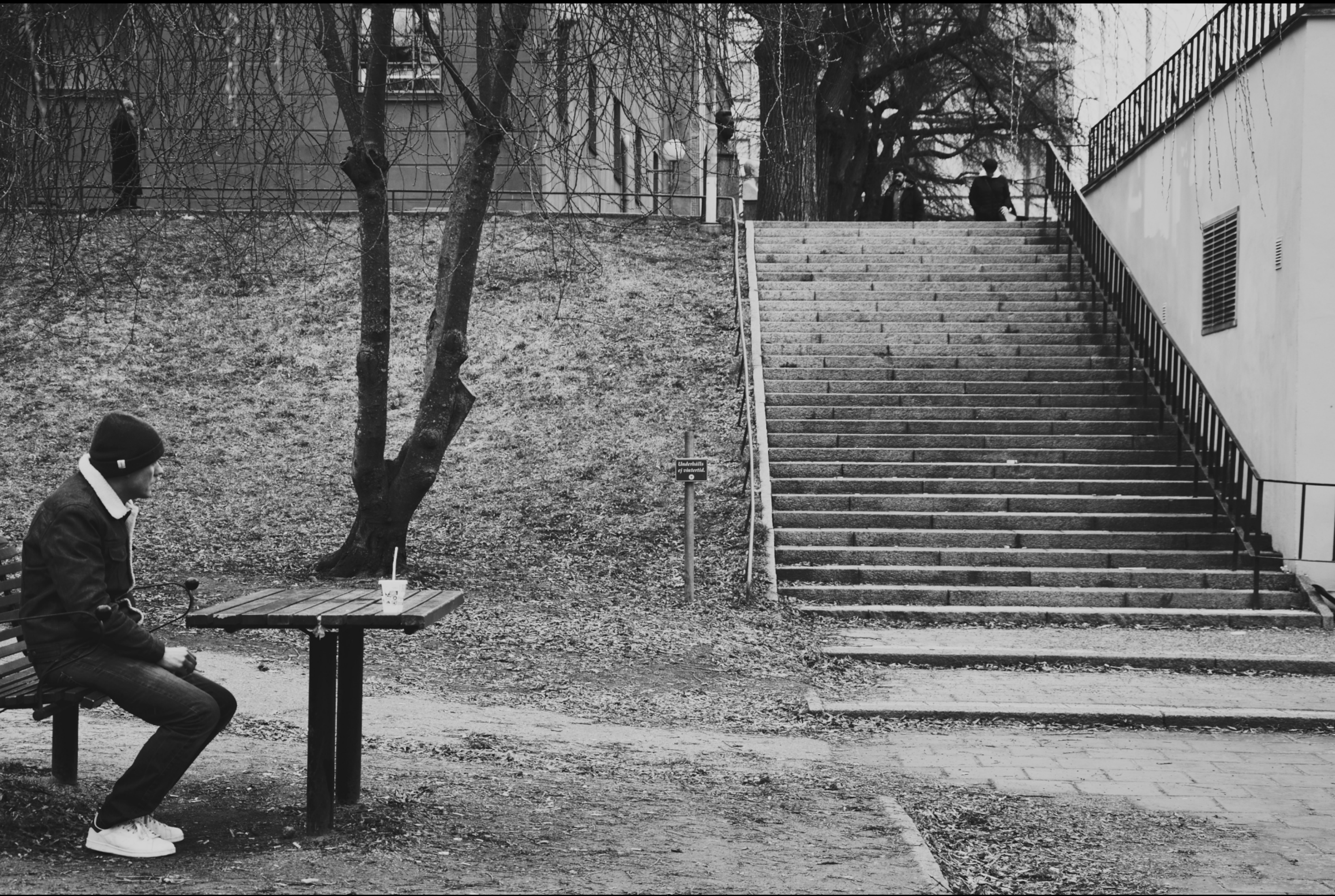
Winter, a very cold and frosty day. He was waiting for anybody who could be interested in him. There wasn't anybody. Stockholm, 2015.