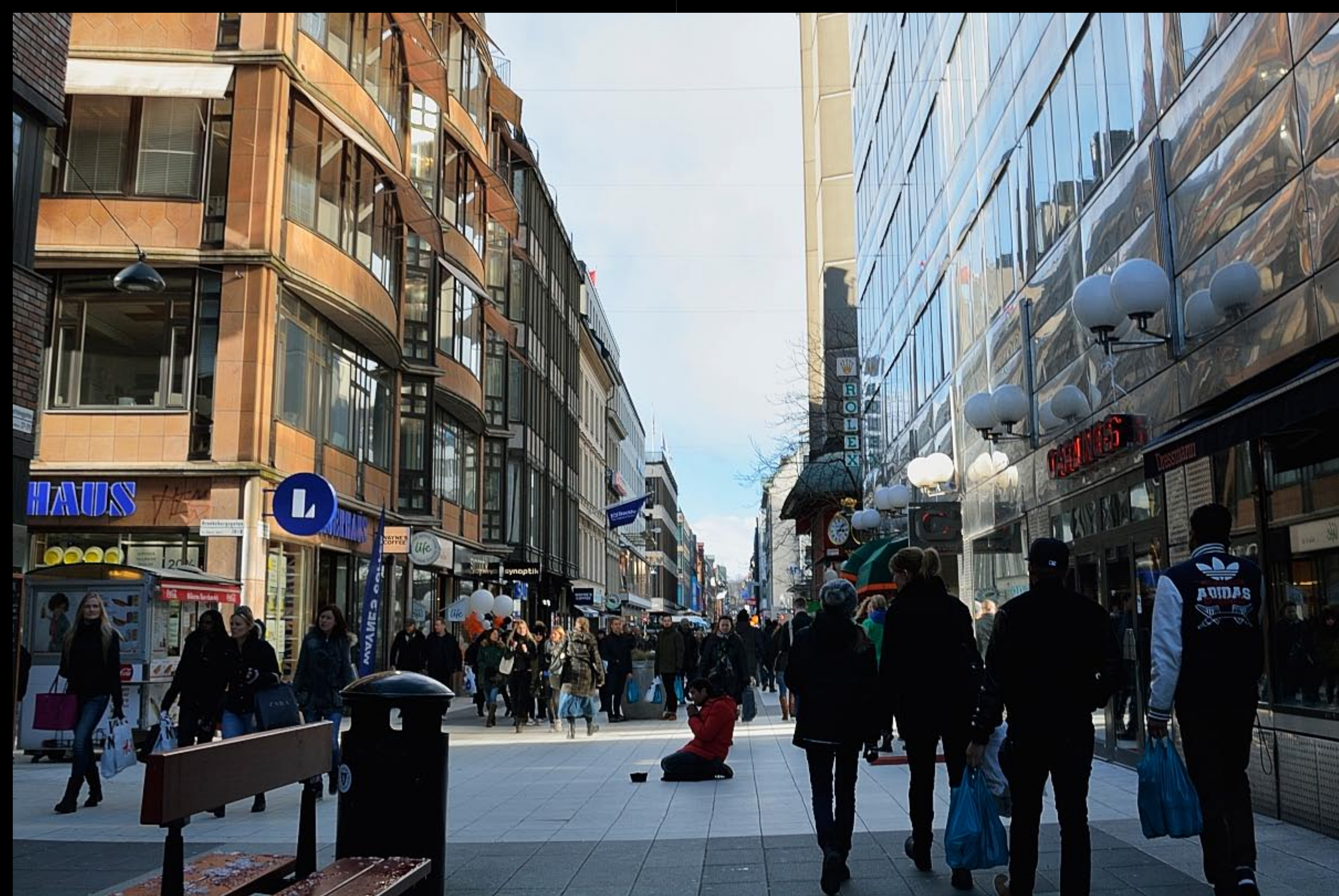
The invisible man. People passed him like he never existed. Stockholm, 2015.