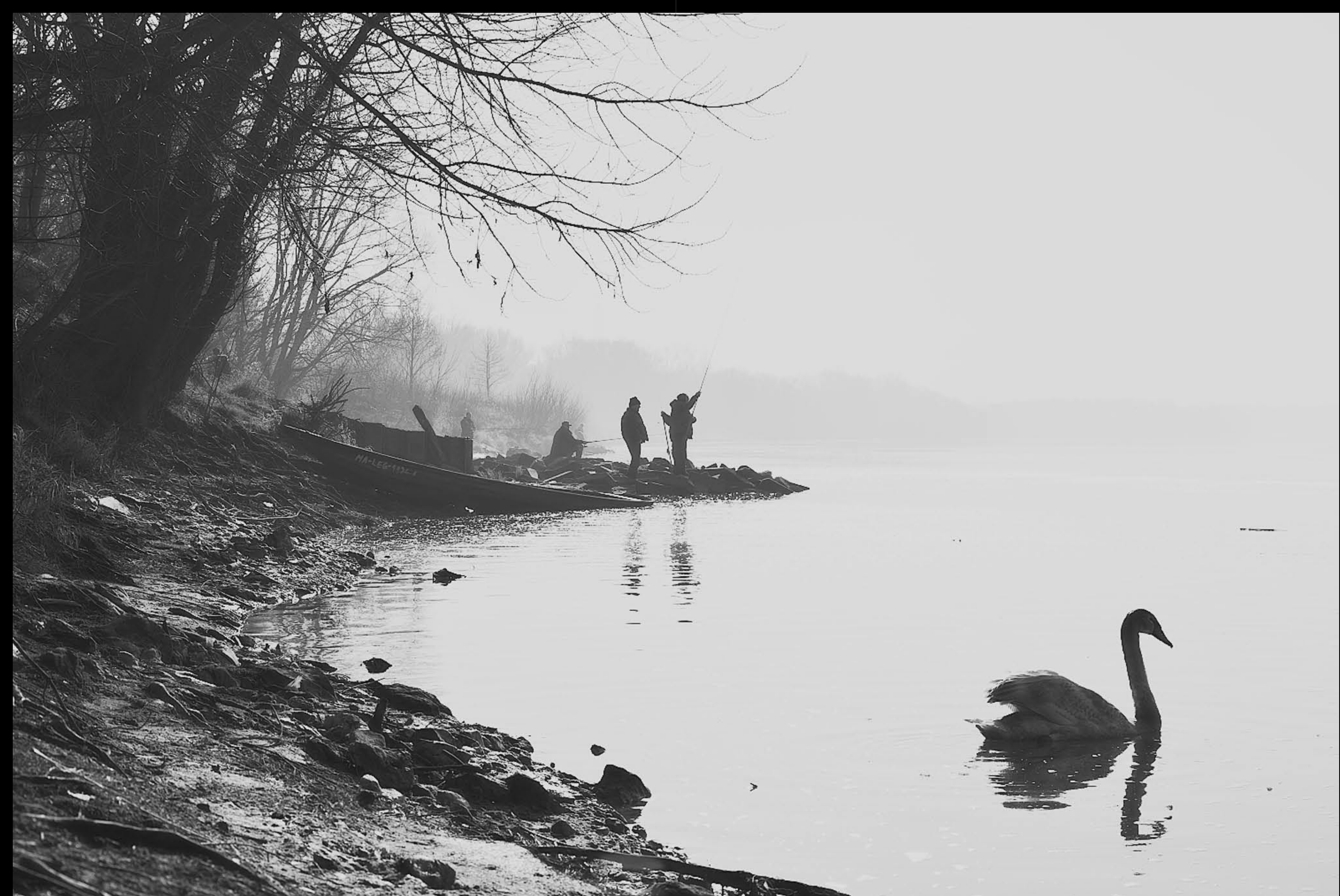
The angler in the capital of Poland. Warsaw, Vistula 2015.