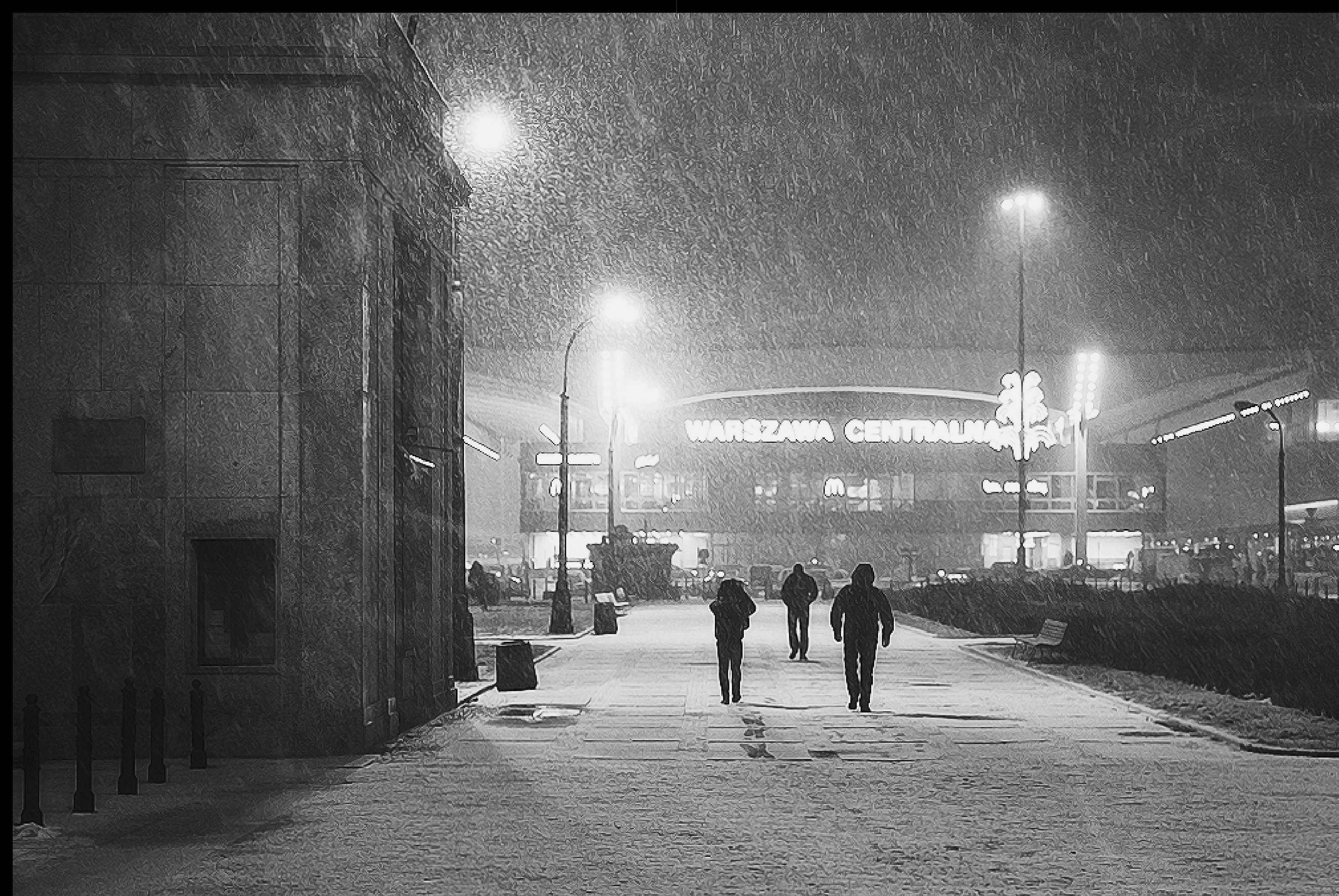
The Warsaw winter night, this photo reminds me that each of us has someone to whom returns. Poland, 2015.