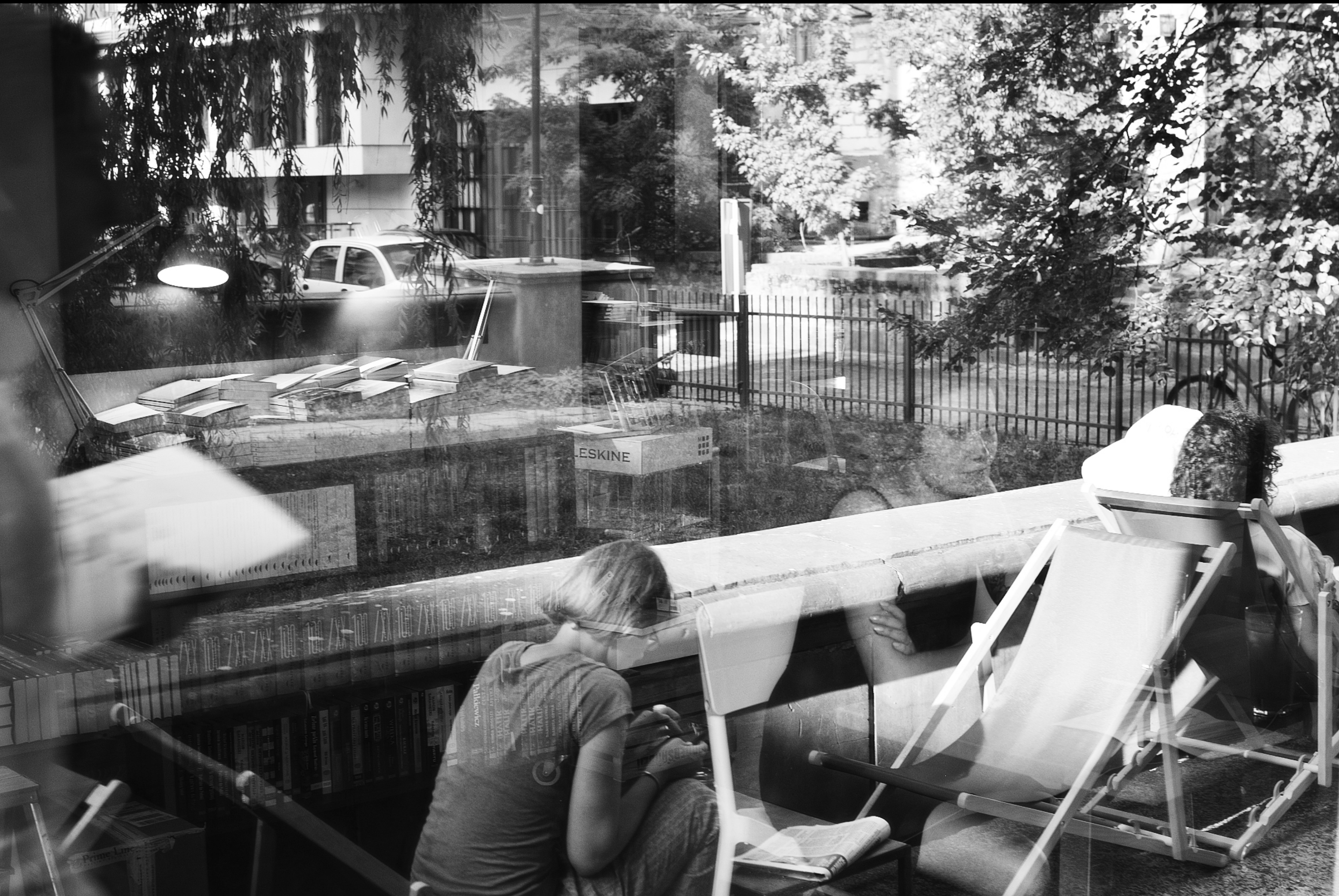
A place of thinking. People go there to working and talking to each other. Warsaw, 2015.