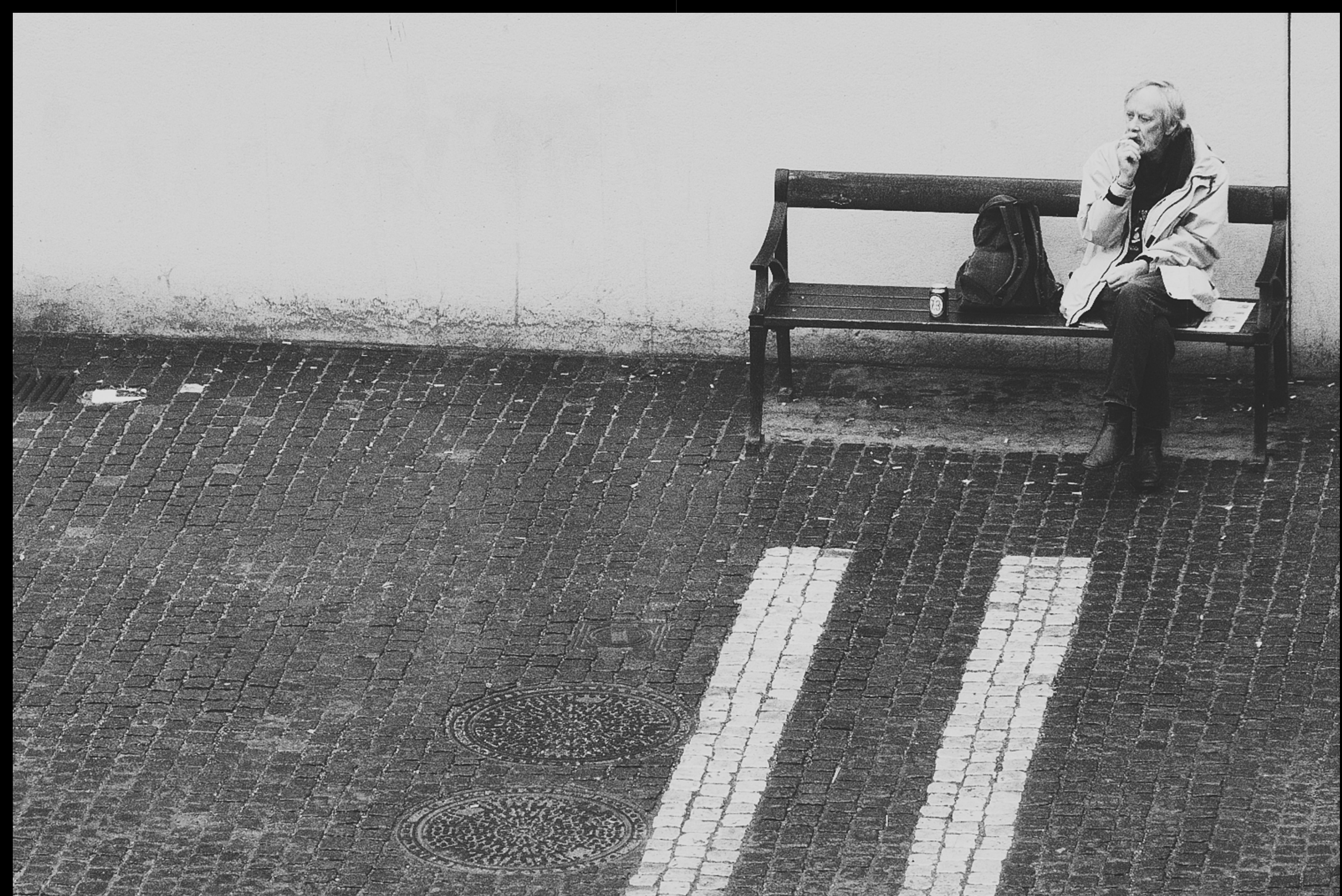
The man who is sitting on the bench and thinking about the past. Stockholm, 2015.