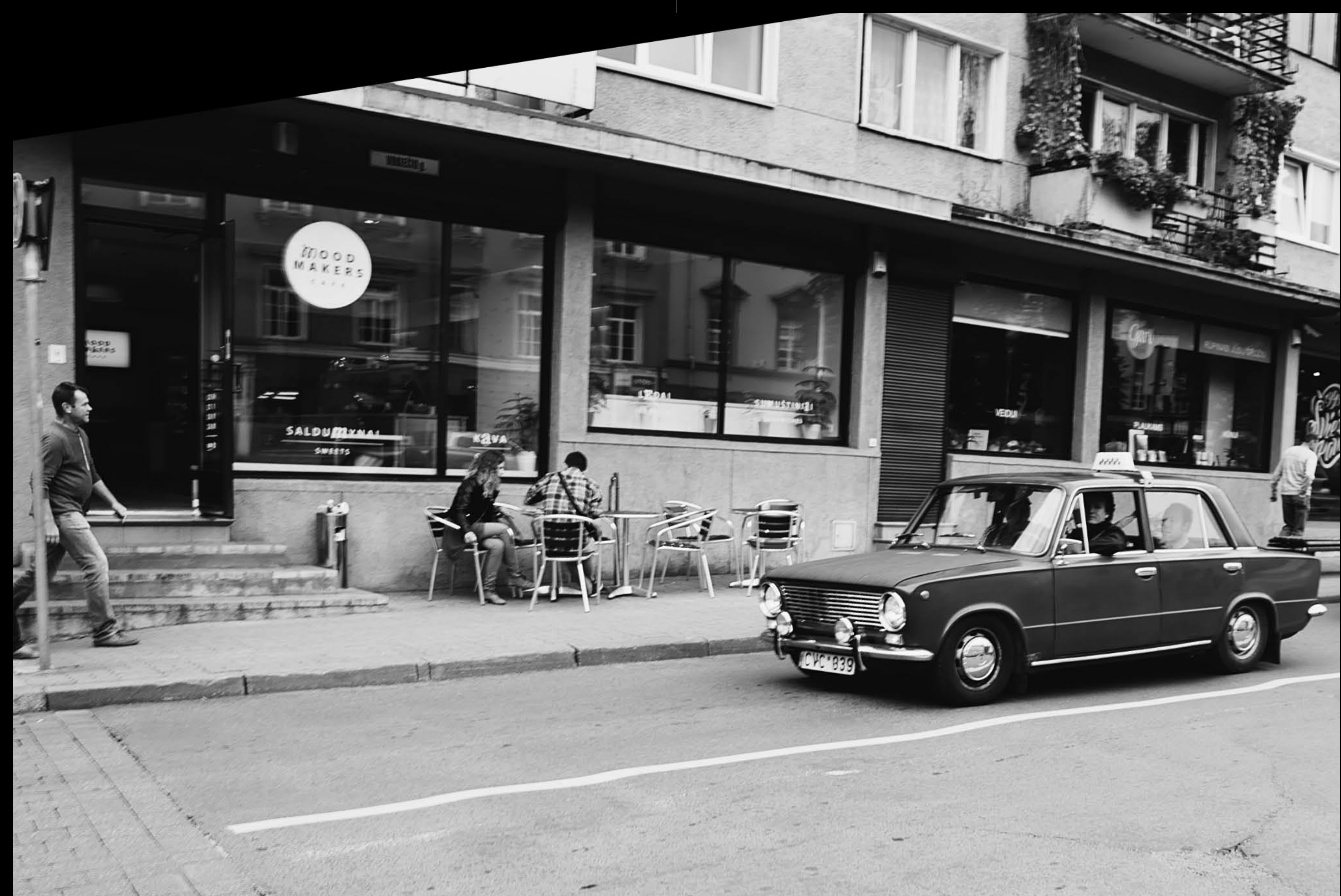
Young people in vintage car. History goes on. Vilnius, 2015.