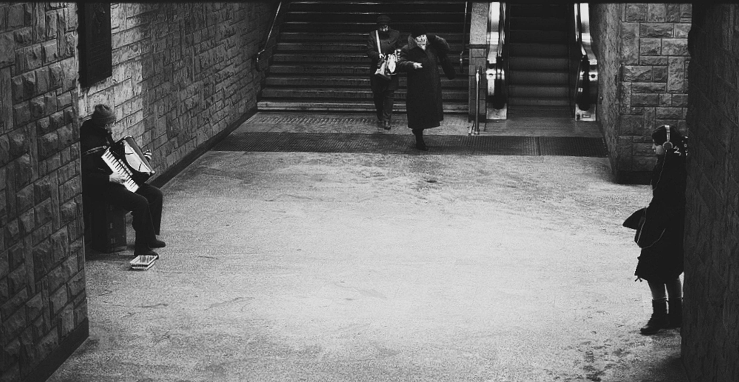
Past and future. Everyone has different music. Warsaw, 2015.