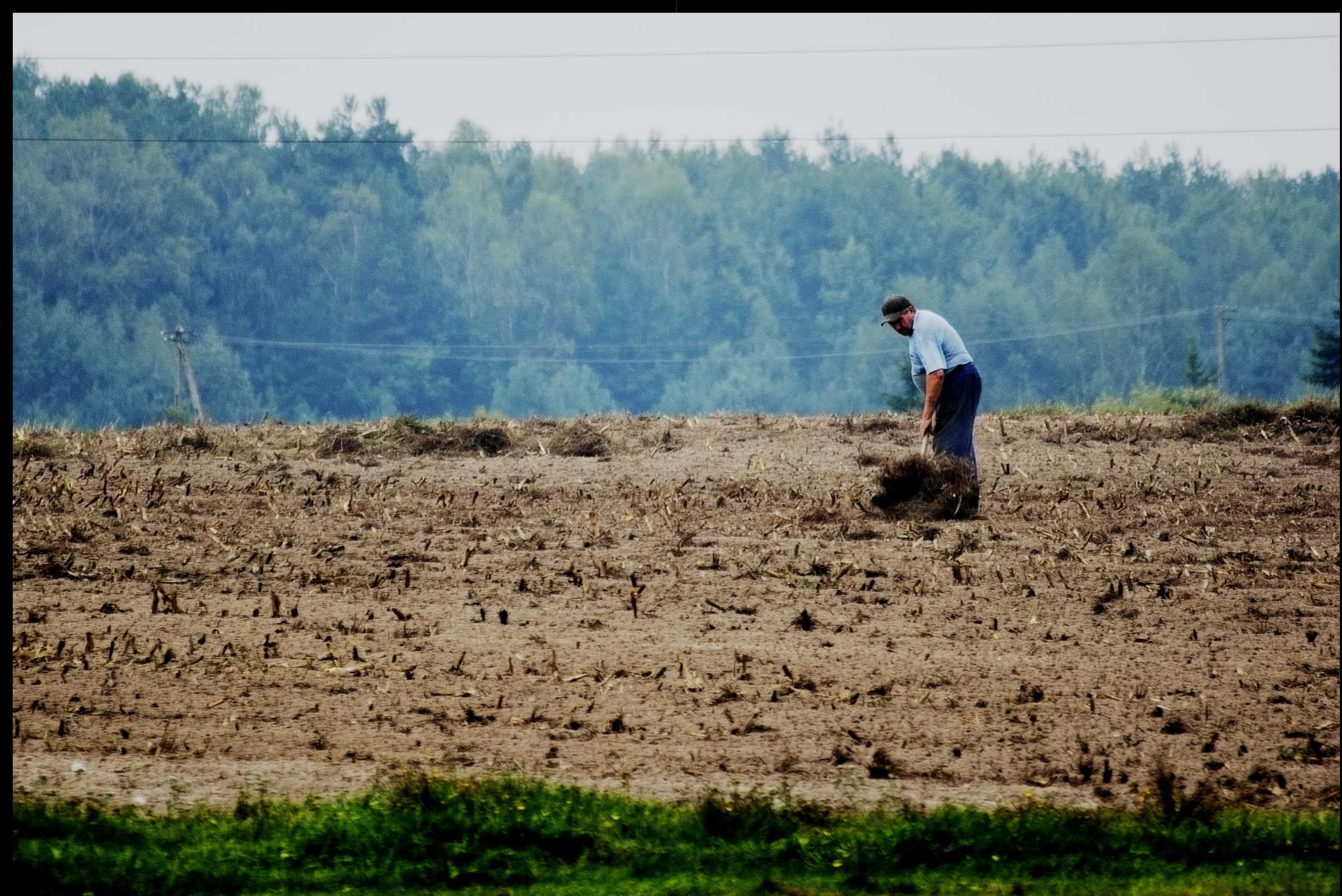
Someone somewhere unprecedented surreal image of a man for whom working with nature is everything. Poland, 2015.