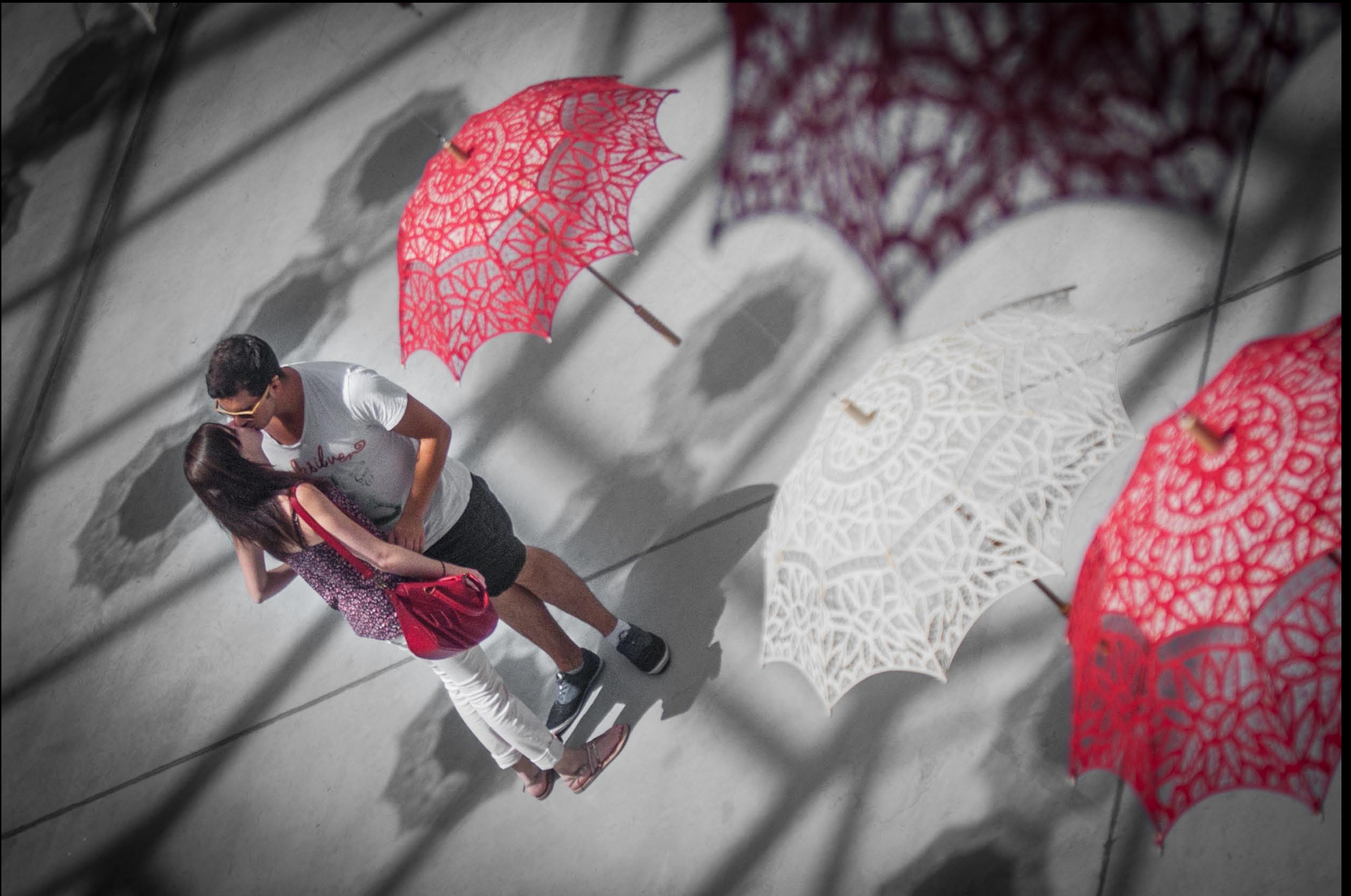
In my practice there are recurrent subjects: childhood, the time that goes by, the lovers... The latter is one of the finest photographic subjects because it speaks to each of us. They are easy prey. Nothing exists around them, they are in their bubble. A boon for us since, unusually, we can move around them with the necessary time to find the best angle. To create an emotion inside other people is the greatest reward ever, this means the picture works.