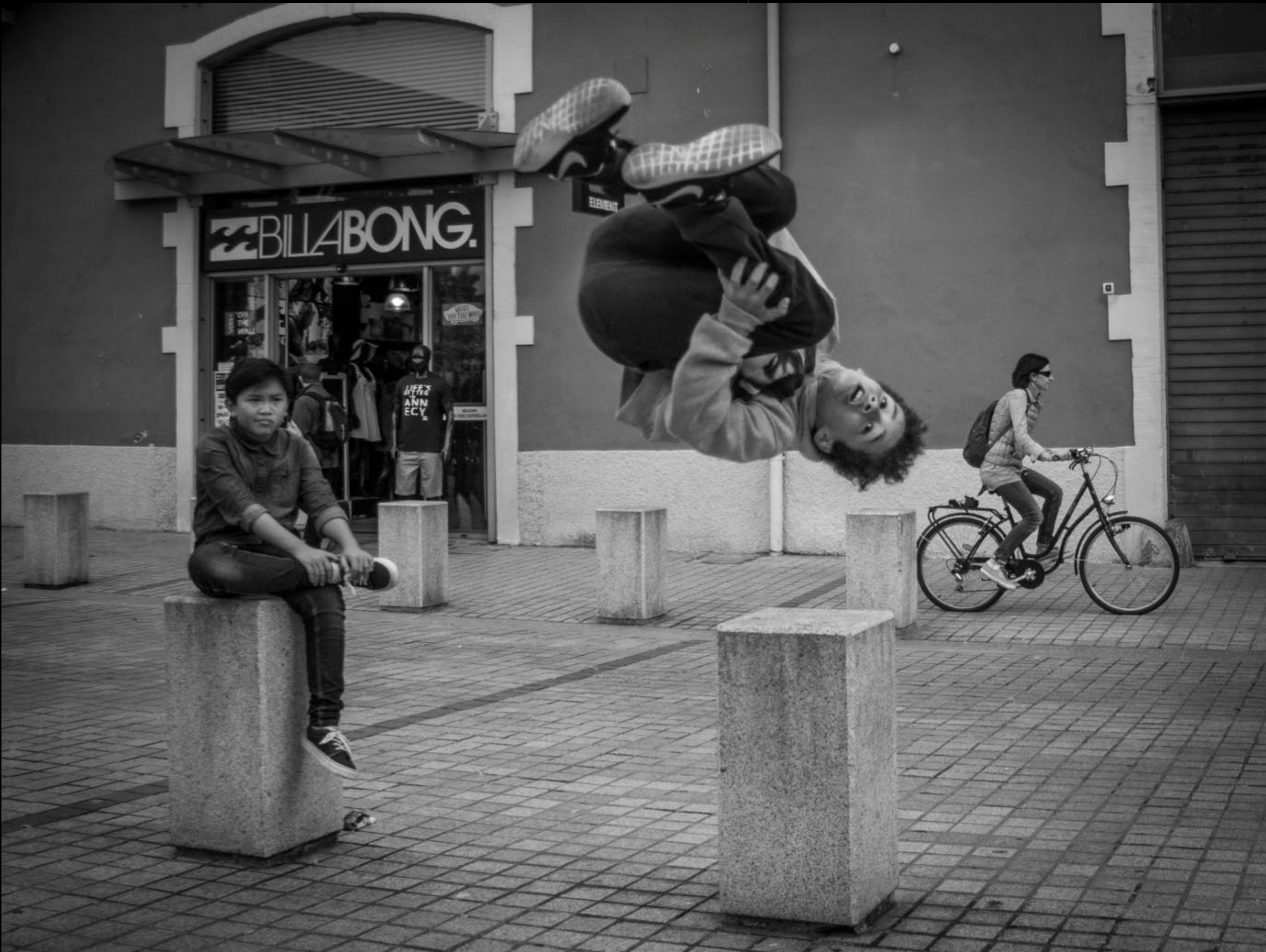
After taking photos, I try to establish a contact with my „model of the day“ to note his email address and be able to send his pictures if he wants. In general people are surprised, happy and as the returns are as good as they are now, I will continue to do it. It is a humanist sharing time which allows to meet and chat with an eclectic population. And that may be the goal: sharing.