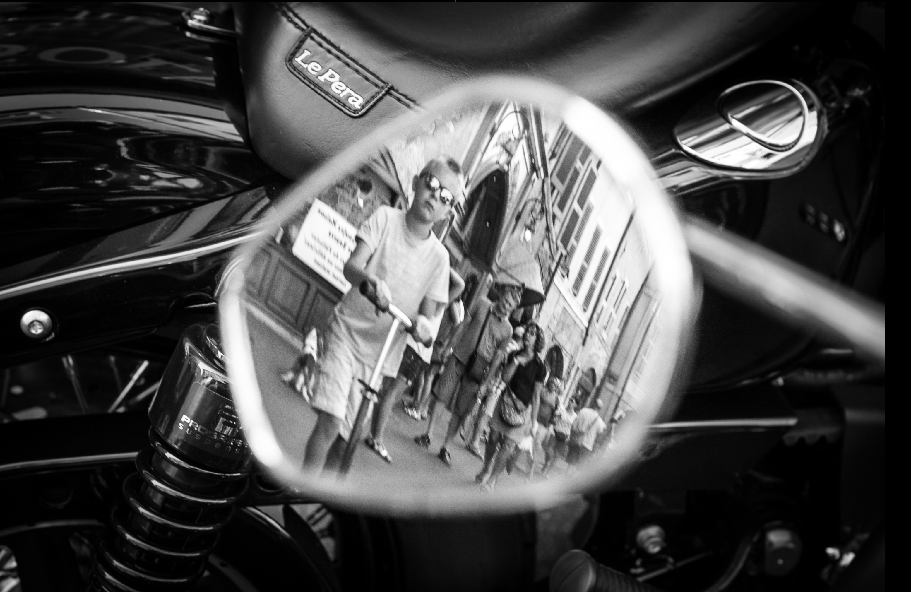
I am a simple photographer, I tell stories through images. In some time maybe I will evolve towards a more abstract, or complex style. But for the moment I focus on the idea of being understood and appreciated by most people, professional until photography hobbyist.