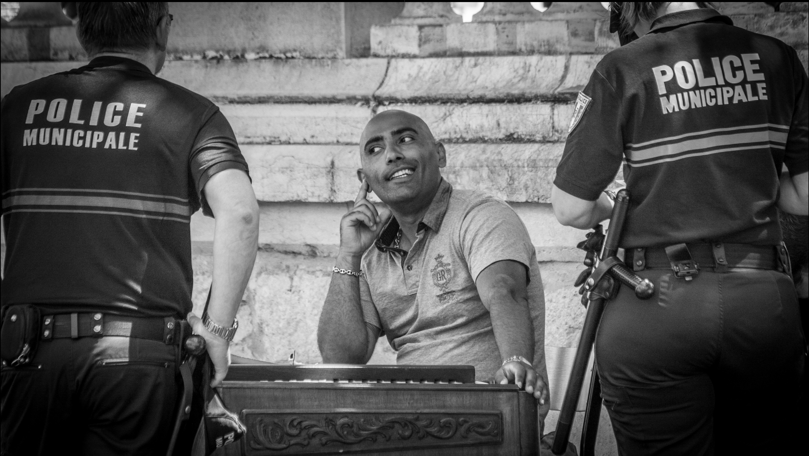
This last picture is representative of what can be street photography to my mind. I was quietly hidden behind a giant flower pot taking a picture of two musicians, a keyboard and a bass. They were playing classical music, and then all of a sudden in my viewfinder, the police! Keep cool, breathe and shoot! To get this one.