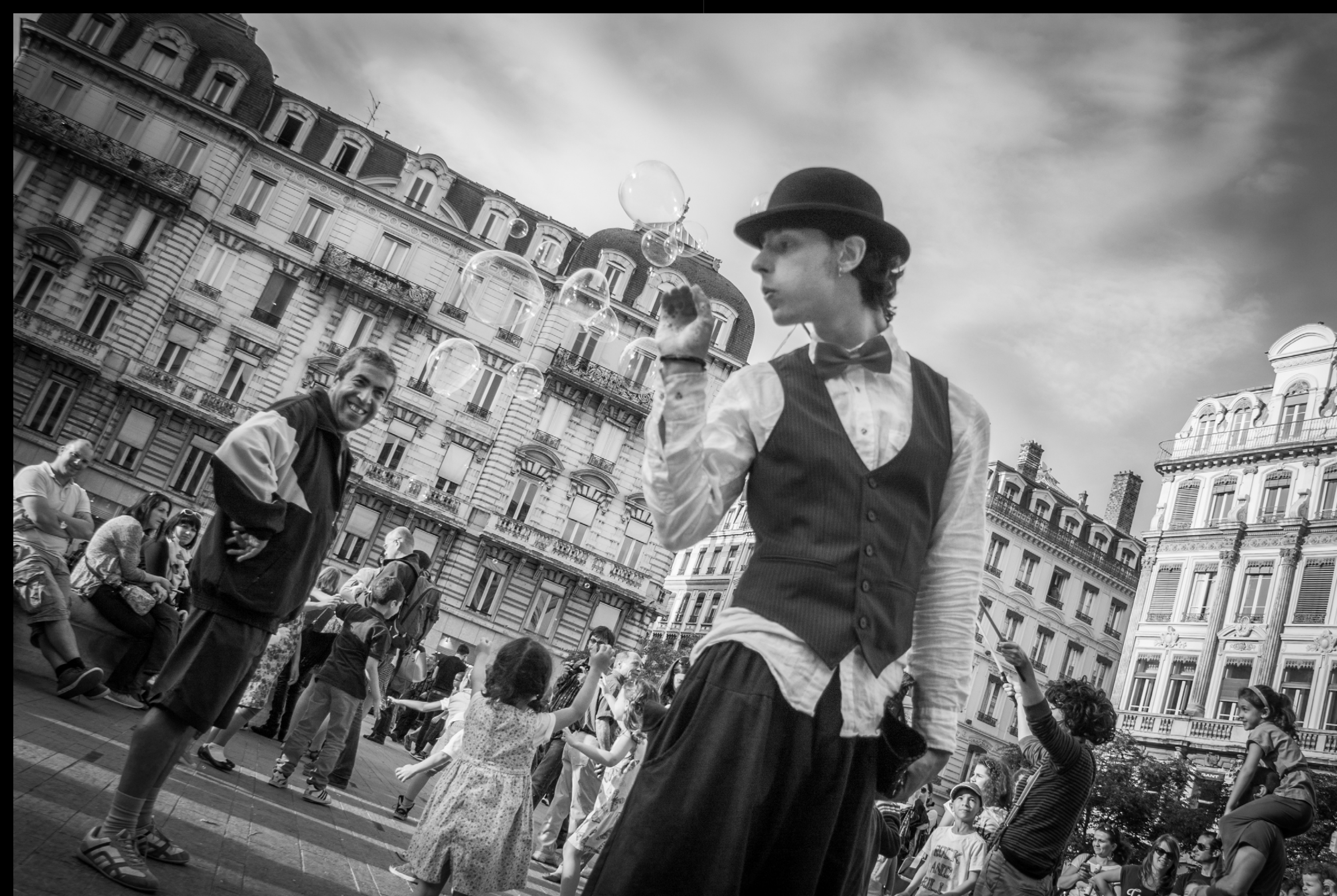
A new eye. I practice street photography for only a few months. I have the impression to discover new things every output. I observe people, graphic buildings, I am in tune with the world around me. I lived the moment with intensity and attention every second to catch the desired image. I learn every day, about others and about myself.