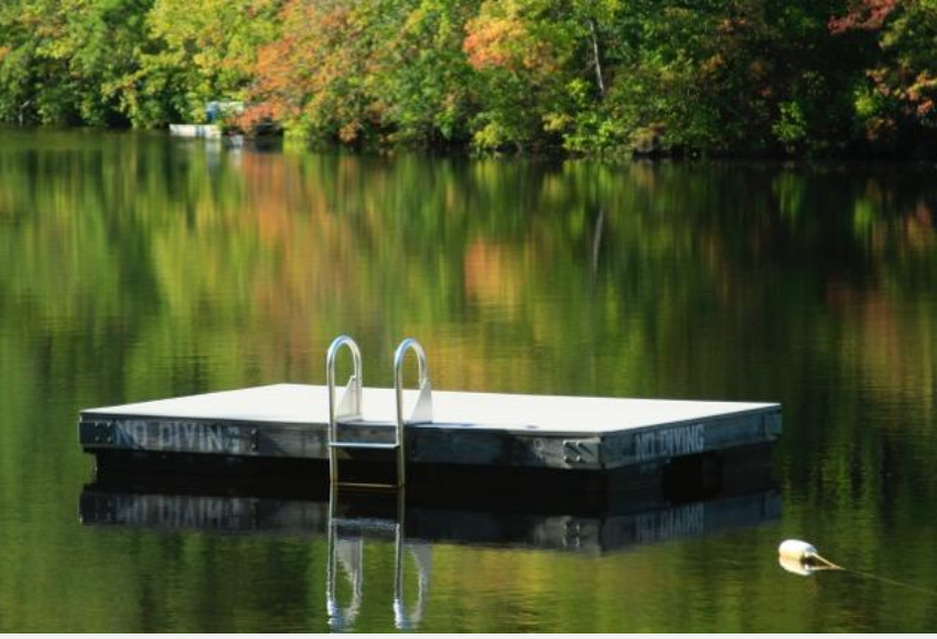
I took this one fall day and it was perfect. I have been back to that spot many times and have never captured anything like this ever again. The diving dock is not all over the place and it just doesn't look the same.