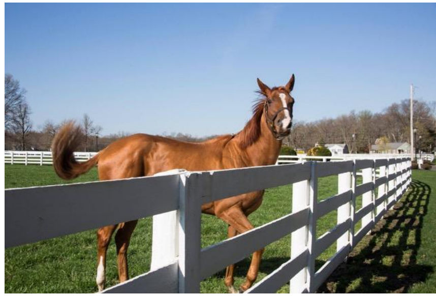
Horse at New Farm, Marlton, New Jersey.