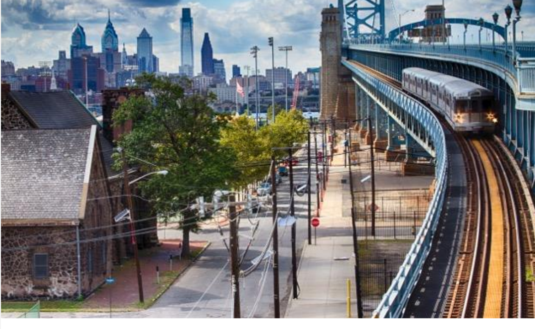
This is a picture of the "high speed" line train that goes from Philadelphia to New Jersey and vice versa. I was up on the bridge leaning over and waited for a train to come through and this was the result.

I PERMANENTLY HAVE A MONO-POD AND TRIPOD IN MY CAR ALTHOUGH MANY TIMES I AM IN SITUATIONS WHERE I CANNOT USE THEM SO I HAVE BECOME VERY PROFICIENT AT TAKING HAND HELD SHOTS. AT HOME I PUT THE PICTURES IN IPHOTO SO I CAN SEE WHAT THEY LOOK LIKE THEN I PICK THE PHOTOS I REALLY LIKE AND WORK ON THOSE IN PHOTOSHOP. I DO NOT DO A LOT OF EDITING BECAUSE I AM IN CONFLICT WITH BEING A PHOTOGRAPHER OR A DIGITAL ARTIST. I VERY RARELY CROP A SHOT AFTER I UPLOAD IT. WHAT I WANT THE PICTURE TO BE IS WHAT I SEE IN THE VIEWFINDER.