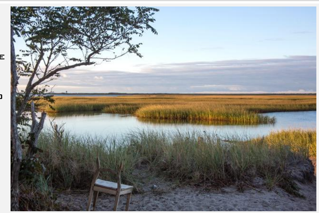
Chair by the tidewater / Provincetown, Massachusetts.