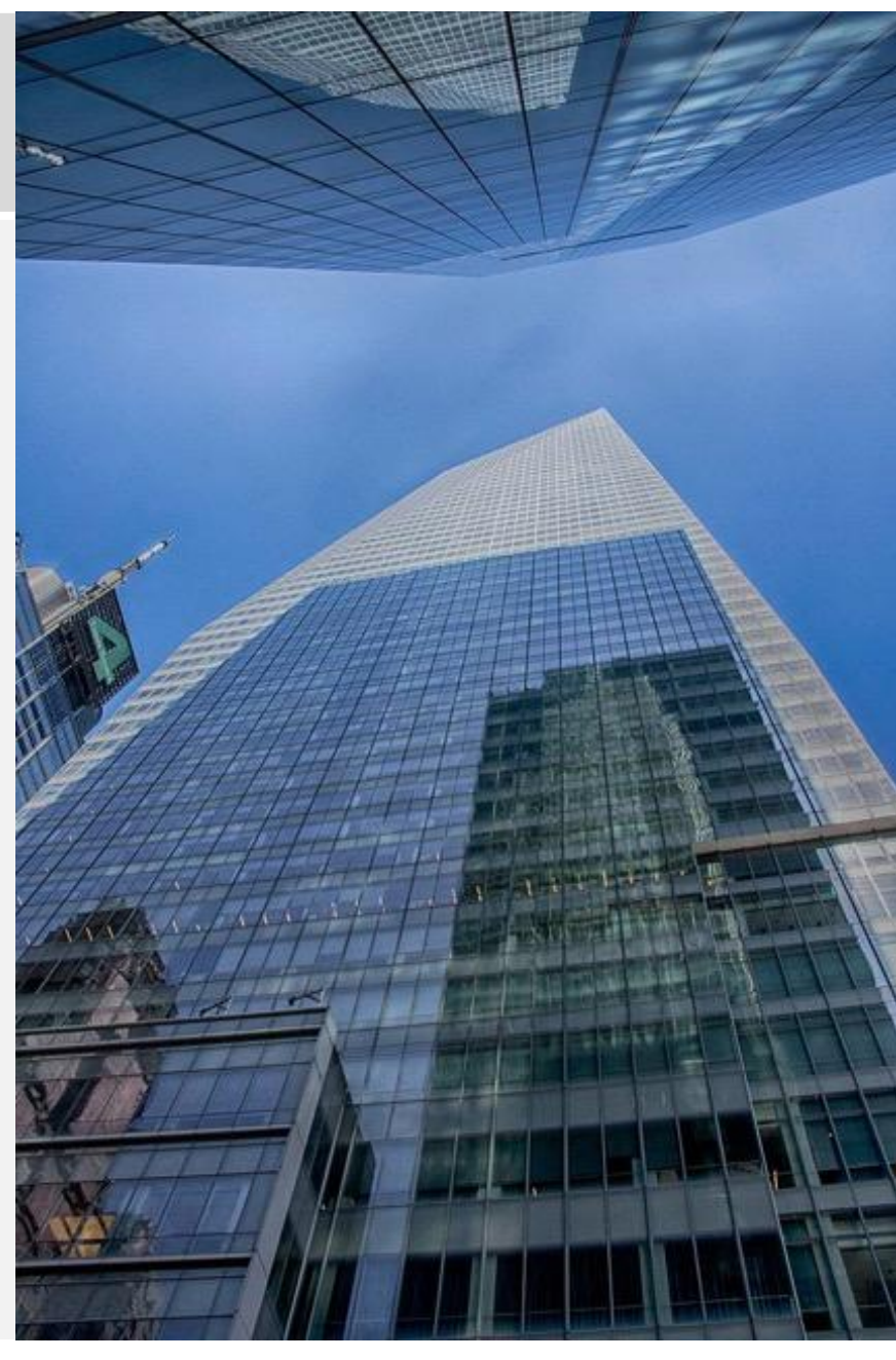
(Sonny Hamauchi ^{\circ} )

I ALSO THINK CREATIVITY IS SOMETHING YOU HAVE OR YOU DON'T. YOU CANNOT BECOME CREATIVE.